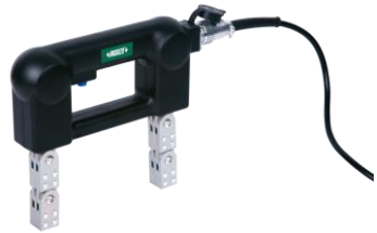
Magnetic Powder Flaw Detectors