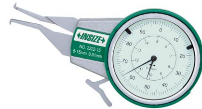
Internal Caliper Gauges