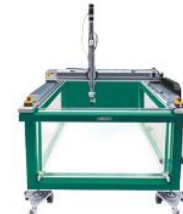
Ultrasonic Water Immersion Detection Systems