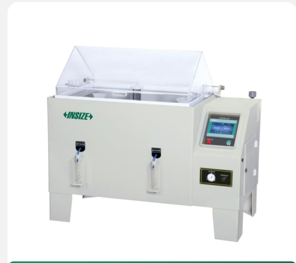
Salt Spray Test Chambers