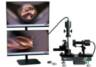
Dual-Display Cutting Tools Microscopes