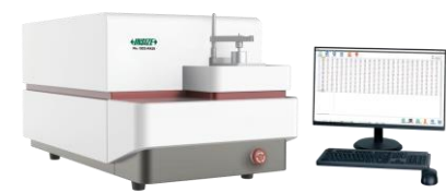
Spark Direct Reading Spectrometers