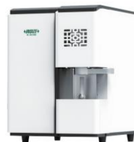
Carbon And Sulfur Analyzers