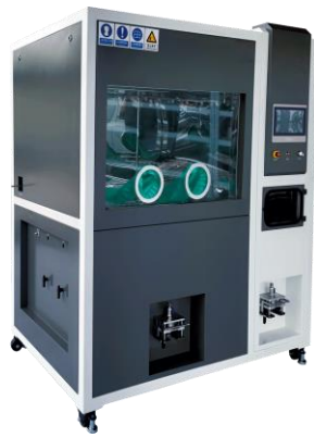
Parts Cleanliness Testing Cabinets