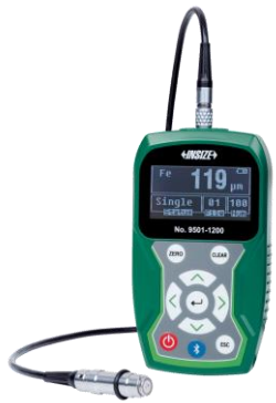
Coating Thickness Gauges