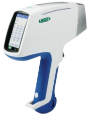
Handheld XRF Alloy Analyzers