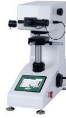
Vickers Hardness Testers