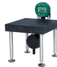
Flatness Measurement Stands