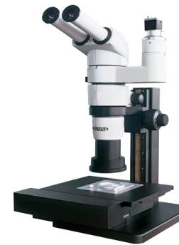
Automatic Cleanliness Analysis Systems