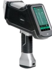
Handheld Libs Spectrometers