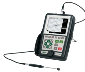
Eddy Current Flaw Detectors