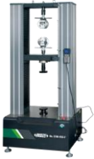
Electronic Universal Testing Machines