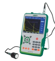
Ultrasonic Flaw Detectors