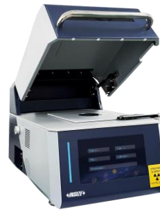
XRF Plating Thickness Instruments