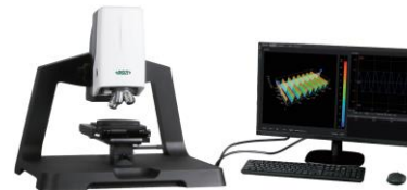
White Light Interference Measuring Microscopes